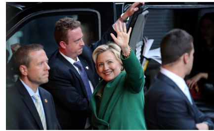
LIVE: Election 2016

LONDON A large sculpture of a bare backside and a model train were among the artworks unveiled at the Turner Prize exhibition in London on Monday in the run-up to Britain's annual contemporary art award.